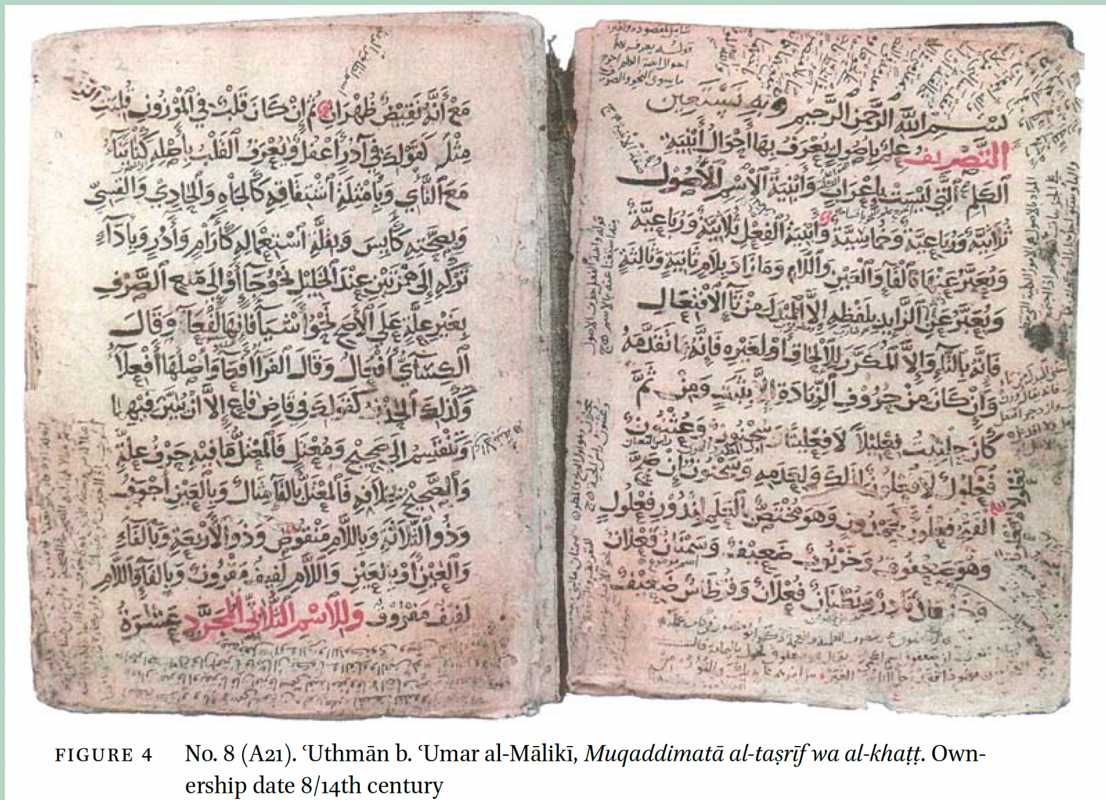
FIGURE 4 No. 8 (A21). 'Uthmān b. 'Umar al-Mālikī, Muqaddimatā al-taṣrīf wa al-khaṭṭ . Ownership date 8/14th century